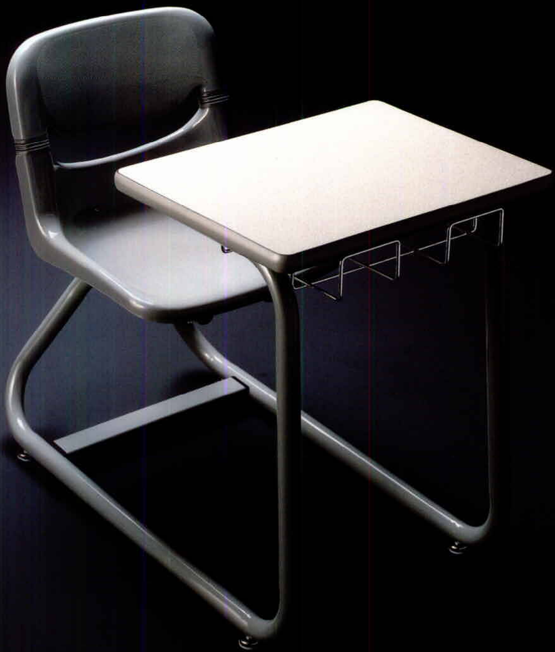
Dorsal® Student Desk