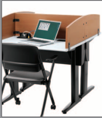
In libraries or resource centers...