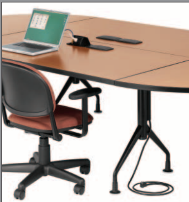
In conference rooms...