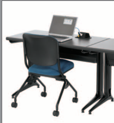
In training rooms...