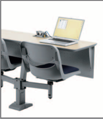
In lecture halls...